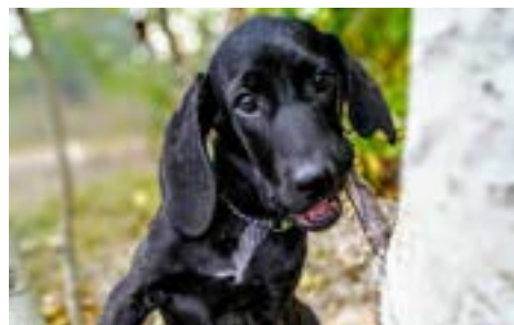
Pumpkin was surrendered by a local family when she needed a new home. Adopted in October 2018.