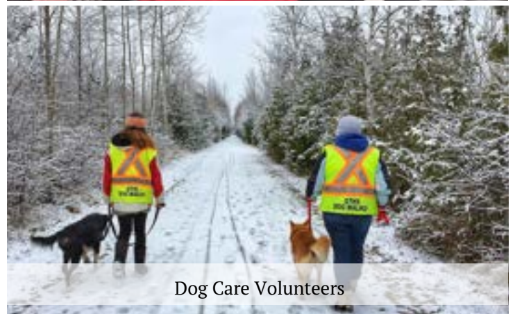
Dog Care Volunteers

In 2018, GTHS volunteers dedicated over 28,487 hours of time to homeless animals either directly or through shelter services.